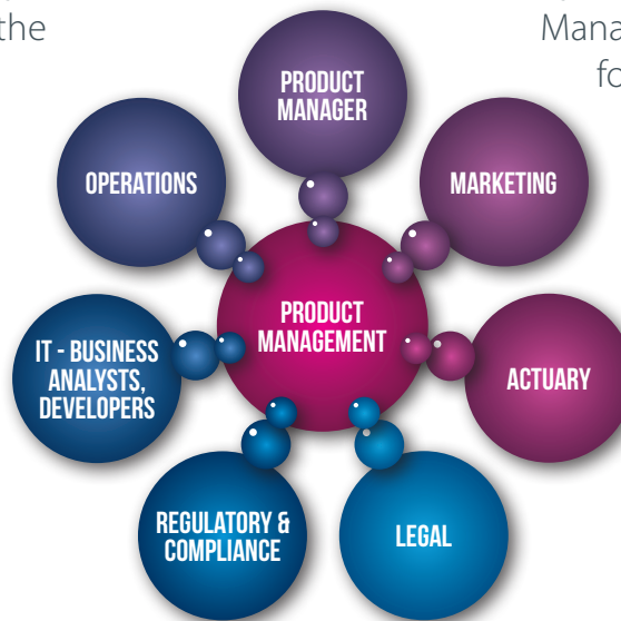
fig 1. PLM Interested Parties

PMW significantly benefits the Product Management Community and its formal approach to describe the product ensures that it can be consumed by IT.